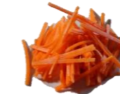
fine julienne – 5-6.5cm long x 1.5mm square