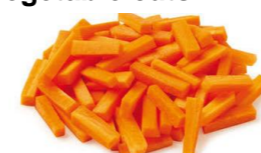
batons – 5-6.5cm long x 1 cm square