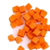
dice – 1cm square