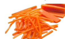
julienne/match stick – 5-6.5cm long x 3 mm square