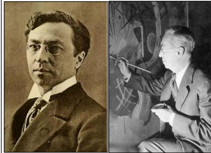
-Kandinsky lived between 1866 and 1944. He was born in Moscow, Russia. However, he later moved to France and became a French citizen.