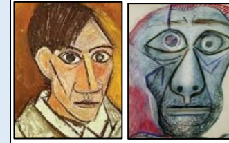
Self-Portraits: Aged 25 (1906) and Facing Death (1972)

-Picasso completed many, many self-portraits throughout his life, which reflected his constantly-changing style. -Aged 25, Picasso had already begun developing his trademark cubist style. The later 1972 portrait demonstrates a number of elements of surrealism that had found their way into his work.