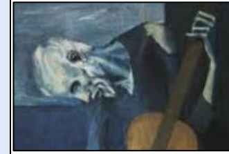
The Old Guitarist (1903)

- The Old Guitarist is perhaps the most well-known of the paintings from Picasso's Blue Period. -It was painted just after the death of his close friend, Casagemas. -It shows a thin, skeleton-like figure with distorted features. The brown guitar is the only shift in colour from the depressing blue tint throughout.