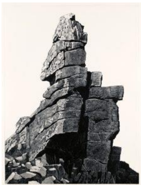
Stack Manstonerock