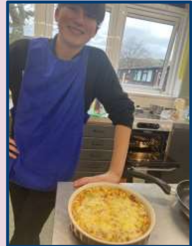
Fantastic preparation and presentation of his Frittata. Looking at Denaturation and Coagulation of Proteins.

Year 9 students have been busy in the cookery room this week making Frittata's.